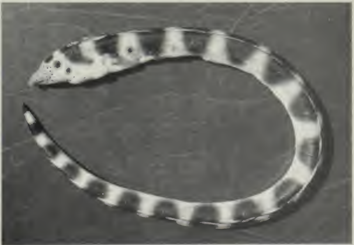
Fig. 3 - The presence of the dark saddle-like patches makes this taxon unique among Mediterranean anguilliformes.